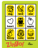
"Z is for ZINGO!"